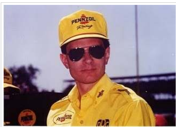
Caption: Feeling oh-so-regal at Indy.

007.i, 008.a, 009.c, 010.c, 011.c, 014.a, 015.fc, 016.a, 017.n, and hopefully several more! Also, I was the chief engineer for the design and construction of the Eclipse Concept Jet and 2 generations of Swift Killer Bee UAVs.