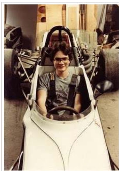
Caption: Here he is folks, the happiest kid in the world! It's a $1500 race car! It's also the best handling car I have ever driven. I wish I still had it. It's a Caldwell D9, the first American made Formula Ford.