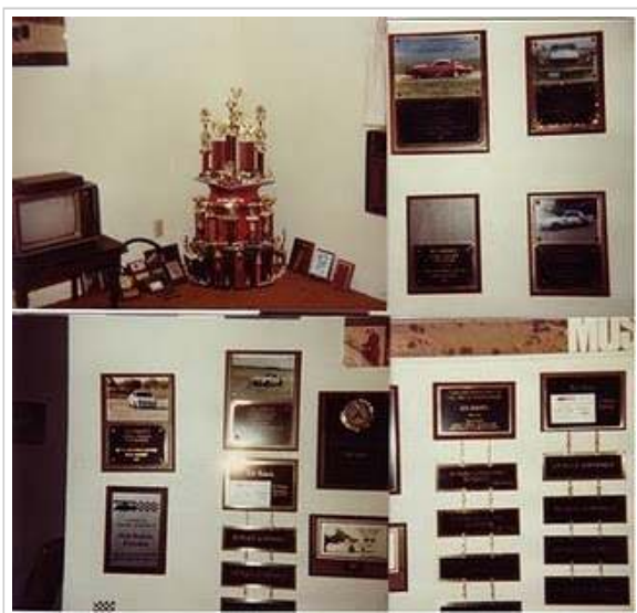
Caption: The trophy collection from my time in the Texas A&M Sports Car Club. It's all about priorities: 13" TV, 40 tires stacked up in the closet.