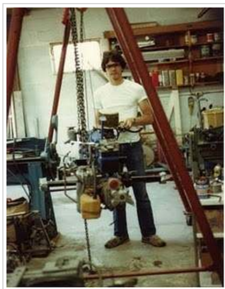
Caption: $1500 race cars need a little TLC.