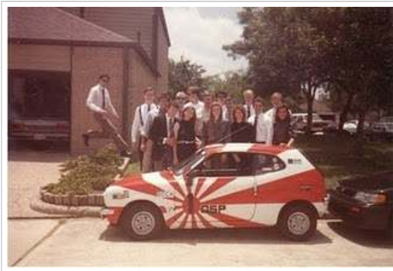
Caption: Late arrival at a special event.