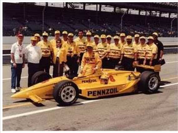
Caption: Where's Fireballs? 1993