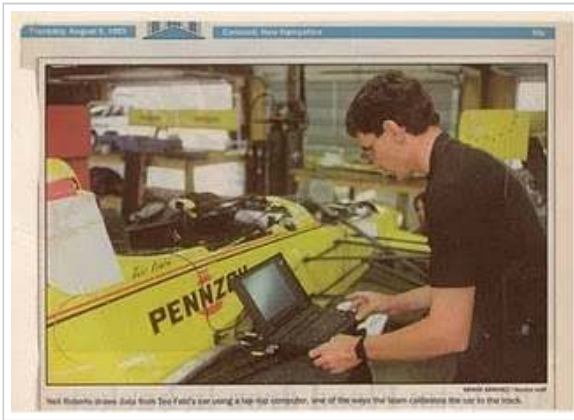
Caption: Feeling totally geeky and scientific in New Hampshire.