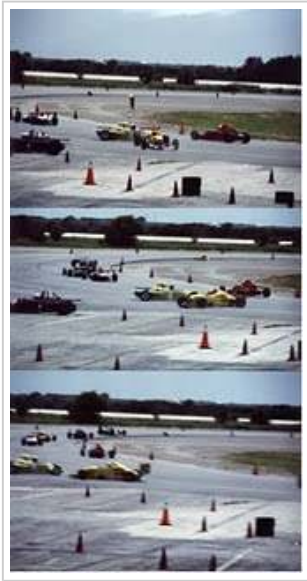
Caption: Some days, the bear eats you.