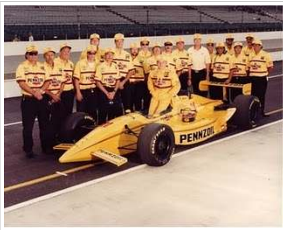
Caption: Where's Fireballs? 1994