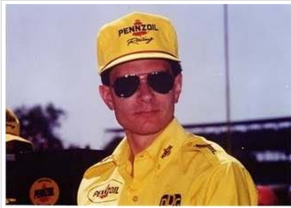
Caption: Feeling oh-so-regal at Indy.

007.i, 008.a, 009.c, 010.c, 011.c, 014.a, 015.fc, 016.a, 017.n, and hopefully several more! Also, I was the chief engineer for the design and construction of the Eclipse Concept Jet and 2 generations of Swift Killer Bee UAVs.