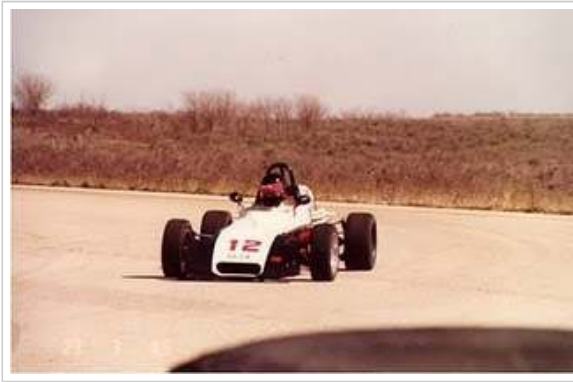
Caption: Dodging the rattlesnakes at Big Spring, TX during my first SCCA road racing driver's school.

I liked racing so much that I wanted to make a career of it, so I dove head-first into aerospace engineering, specifically to become a race car engineer. I had an absolute blast in the Texas A&M Sports Car Club, and was the president of the club for a year. Jim Hall gave me a massive break by hiring me for his start-up Indycar team right out of college, and boy did I ever learn a lot in a hurry!