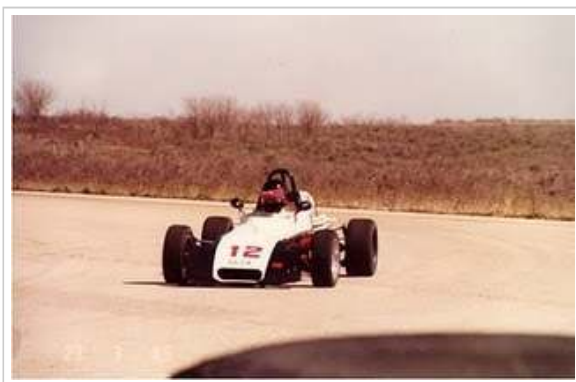
Caption: Dodging the rattlesnakes at Big Spring, TX during my first SCCA road racing driver's school.

I liked racing so much that I wanted to make a career of it, so I dove head-first into aerospace engineering, specifically to become a race car engineer. I had an absolute blast in the Texas A&M Sports Car Club, and was the president of the club for a year. Jim Hall gave me a massive break by hiring me for his start-up Indycar team right out of college, and boy did I ever learn a lot in a hurry!