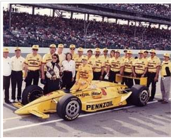
Caption: Where's Fireballs? 1992