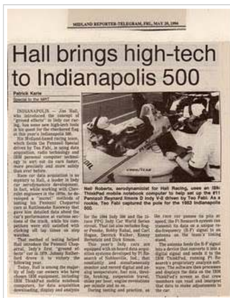
Caption: Feeling a pattern developing here.

My wife and two young boys keep me very busy! I use the commute to and from work as my daily driving entertainment fix, I'm an aviation enthusiast, and I'm promoting a racing technology book that I wrote: Click here to check it out!