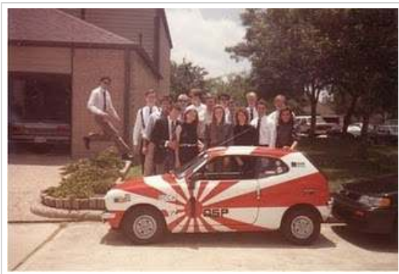
Caption: Late arrival at a special event.