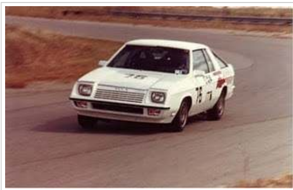
Caption: Drive it, Man!