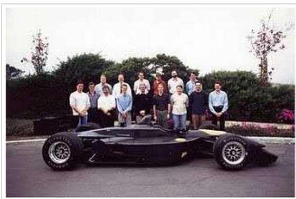
Caption: Awesome engineers, awesome car.