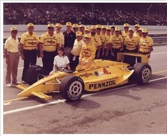
Caption: Where's Fireballs? 1991

There are a lot of active motorsports competitors who really enjoy the thrill of competition on wheels and have a real hunger for sensible, practical advice on how to develop themselves and their equipment into a winning program. Think Fast does that, but in a different way than any other book that I know of. It is focused on why to do some things and why not to do other things in order to win. To sum it up, Think Fast teaches racers how to develop a complete strategy for success, and how to realize that success.