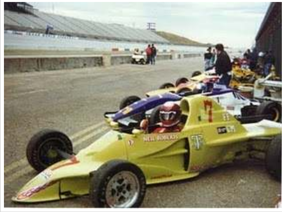
Caption: Leading the grid ... at another driver's school.

I started in August of 1996, so the 007.i Indycar design was well under way for debut in early 1997. Despite the fact that I was the last engineer hired of 15 who worked on that car, I designed 28% of its parts! I have worked with a lot of great people, but I'm still the fastest engineer I know.