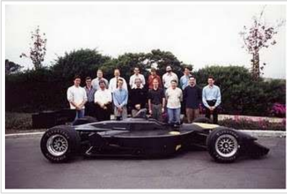
Caption: Awesome engineers, awesome car.