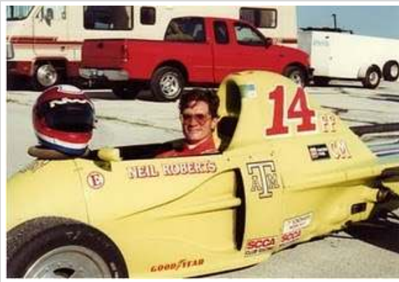
Caption: The return of the happiest kid in the world! I had just lapped the field at Abilene.