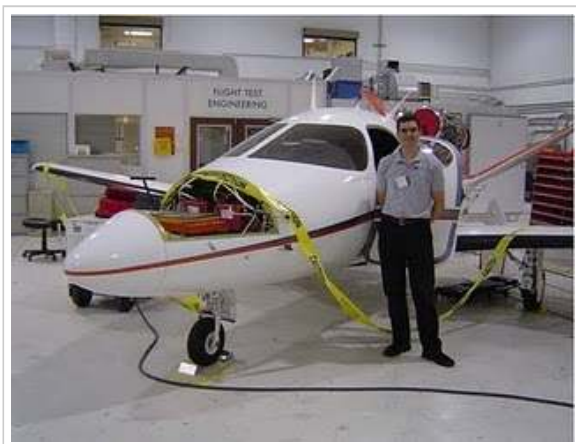
Caption: The happiest kid in the world is the chief engineer of the coolest airplane ever!

They just keep getting better! The numerous concepts and their wide variety reflects the fact that Swift really wants this business! The first set of concepts was revealed at nearly the same time that the IRL released its list of desirable attributes for the next Indycar, so our first concepts went in a different direction. The next set of concepts incorporated guidance from both the IRL and the fans who made suggestions on many of the racing blogs. The current concept is a further refinement and smoother integration of the many inputs, and it is sure to evolve more in the near future. Our concept can be built by Swift right now, since Swift is the only bidder who does not need a start-up manufacturing operation to build real American-made Indycars!