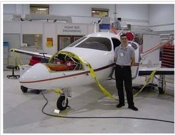
Caption: The happiest kid in the world is the chief engineer of the coolest airplane ever!

They just keep getting better! The numerous concepts and their wide variety reflects the fact that Swift really wants this business! The first set of concepts was revealed at nearly the same time that the IRL released its list of desirable attributes for the next Indycar, so our first concepts went in a different direction. The next set of concepts incorporated guidance from both the IRL and the fans who made suggestions on many of the racing blogs. The current concept is a further refinement and smoother integration of the many inputs, and it is sure to evolve more in the near future. Our concept can be built by Swift right now, since Swift is the only bidder who does not need a start-up manufacturing operation to build real American-made Indycars!