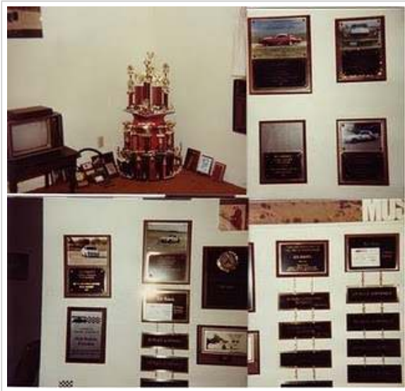
Caption: The trophy collection from my time in the Texas A&M Sports Car Club. It's all about priorities: 13" TV, 40 tires stacked up in the closet.